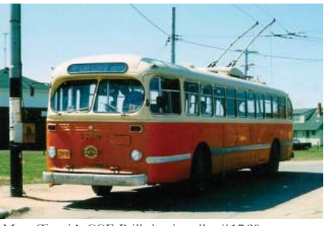
Metro Transit's CCF-Brill electric trolley #1768.

Winnipeg's Transit System has featured many different types of bus models from various manufacturers.