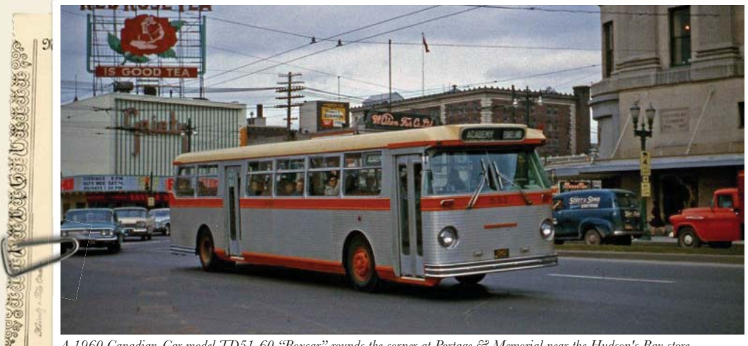
A 1960 Canadian-Car model TD51-60 "Boxcar" rounds the corner at Portage & Memorial near the Hudson's Bay store.