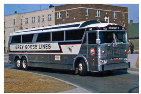
Grey Goose #142, a 1971 MC-7, destined to Toronto.

In this issue, we will feature Bill's documentation of the once mighty regional carrier called Grey Goose Bus Lines which was based in Winnipeg.