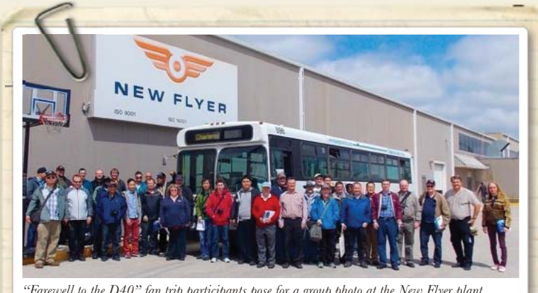
"Farewell to the D40" fan trip participants pose for a group photo at the New Flyer plant