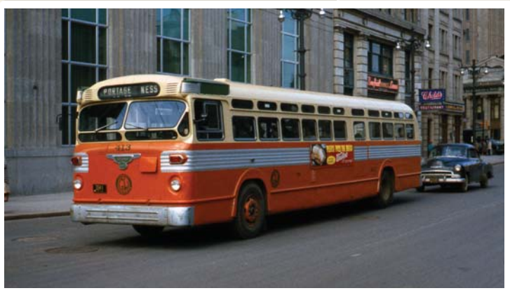
Greater Winnipeg Transit Commission #413, a 1954 Flxible-Twin Coach model FT2D-40.

Additional Winnipeg photos will also be featured in the next issue.