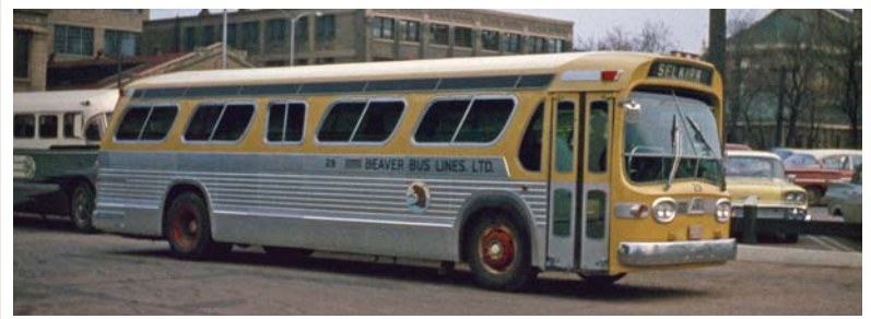
Beaver Bus Lines #29, a 1960 General Motors model TDH-4517, leaving for Selkirk, Manitoba.