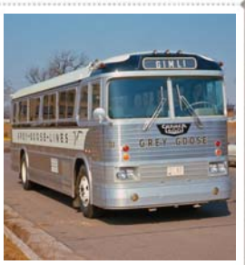
1966 Western Flyer Canuck 500.