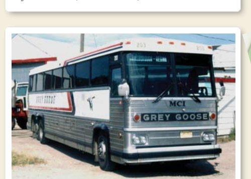
Grey Goose #203 destined to Regina via Gainborough.