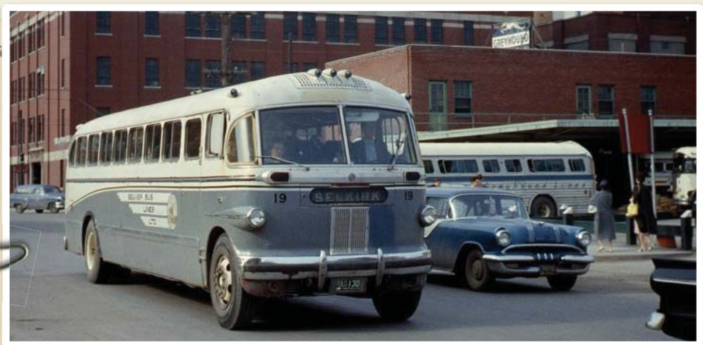
Beaver Bus Lines #19 departs the Union Bus Depot on Graham & Carlton/Hargrave, circa. 1960.

Beaver Bus Lines timetable for November 8, 1948.