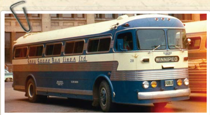
Grey Goose #28, a P-41 "Canuck", in its original blue & silver livery, circa 1960.