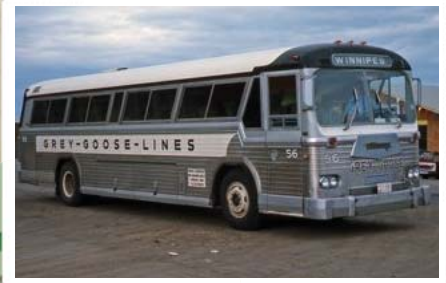
1963 Prevost Car "Panoramique" in Morris, Manitoba.