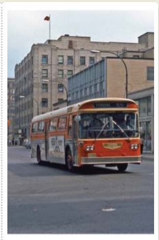
A 1969 Western Flyer Coach D700.