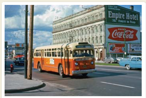
Metro Transit #101, a 1956 General Motors "Old Look".