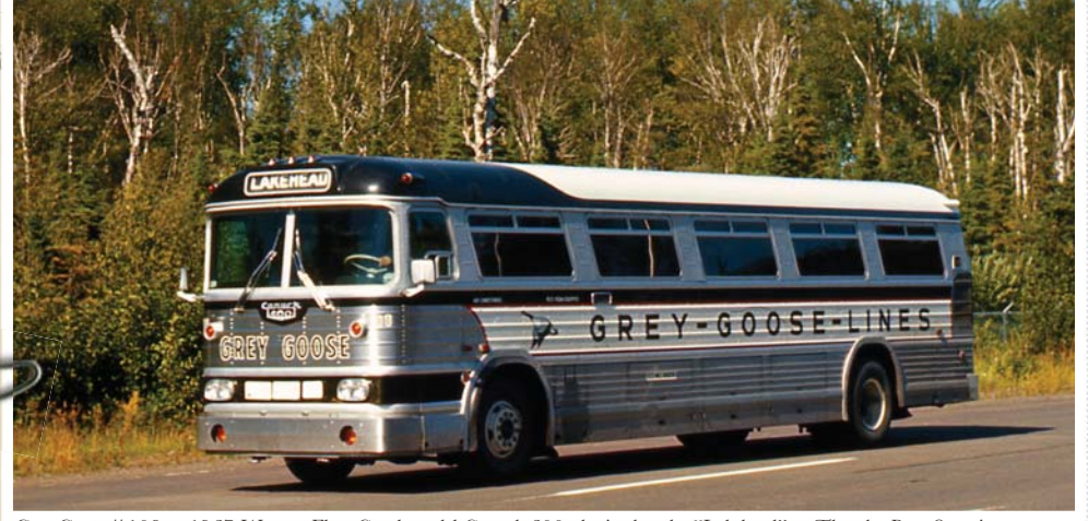
Grey Goose #108, a 1967 Western Flyer Coach model Canuck 600, destined to the "Lakehead" or Thunder Bay, Ontario.