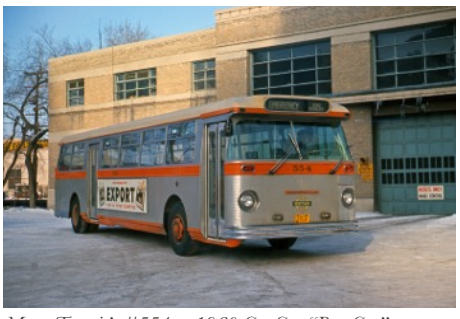
Metro Transit's #554, a 1960 CanCar "Box Car".

Winnipeg's Transit System has featured many different types of bus models from various manufacturers including Canadian Car Foundry, General Motors, and Orion Bus Industries.