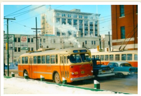
Metro Transit #1662, a 1947 CanCar-Brill model T44.