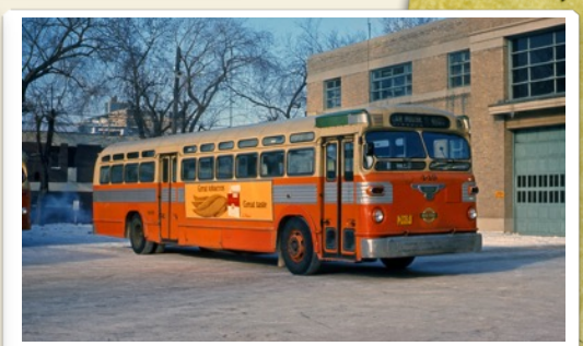
Metro Transit #449, a 1954 Flxible-Twin Coach FT2D-40.