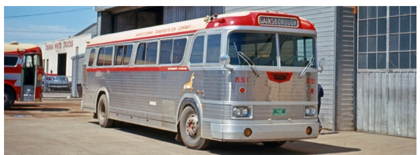
STC #851, a 1964 Western Flyer Canuck 500 seen in Regina, Saskatchewan.