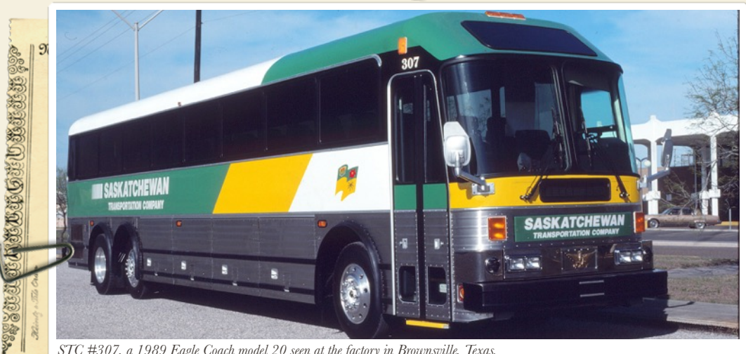
STC #307, a 1989 Eagle Coach model 20 seen at the factory in Brownsville, Texas.