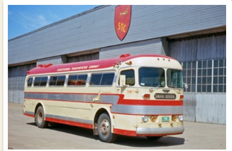
STC #541, a 1960 Western Flyer P37 Canuck.