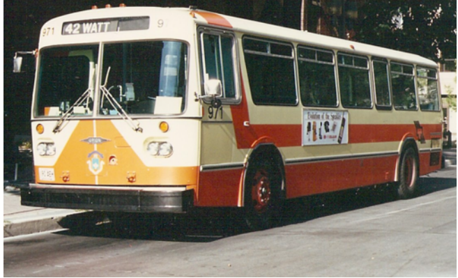
Winnipeg Transit #971, an Ontario Bus Industries model Orion 01.504