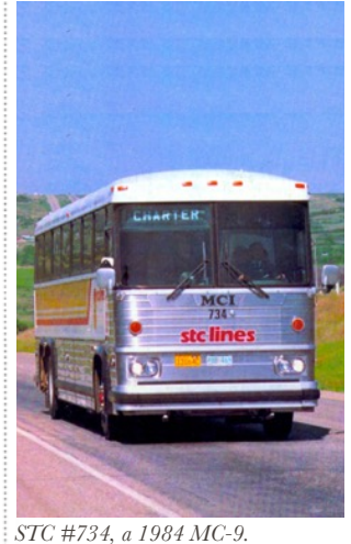
All photographs © Copyright by William A. Luke. Used with permission.