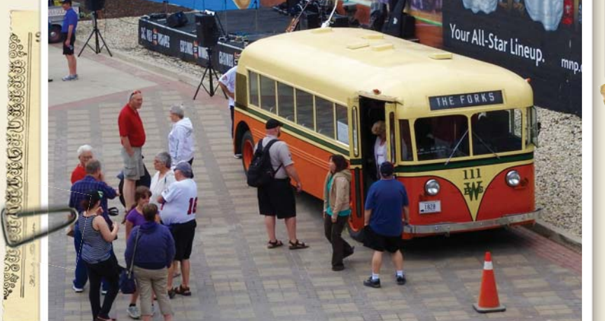
The 1937 Twin Coach on display at a Winnipeg Goldeyes game at Shaw Park.