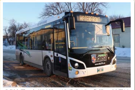
Selkirk Transit #1662, a 1947 CanCar-Brill model T44.