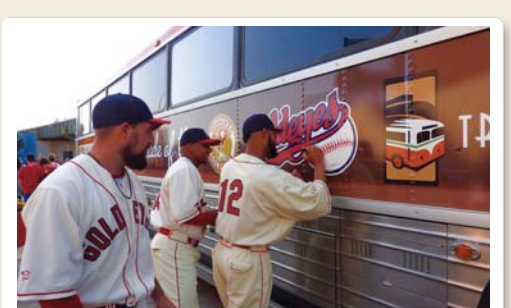
Members of the Goldeyes Baseball Club sign the bus.

As a not-for-profit charity and museum group, the Manitoba Transit Heritage Association takes a "hands on" approach to displaying its collection of vintage buses by offering outreach visits to senior centres, schools and by participating in various community festivals, parades and antique vehicle show & shines.