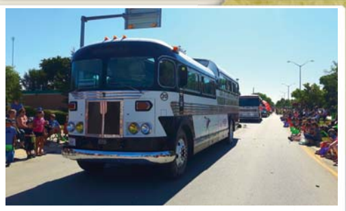
The Scenic Cruiser in the Pioneer Days Parade in Steinbach.