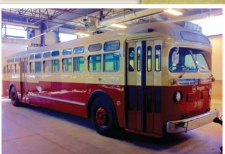
1954 General Motors model TDH4512.