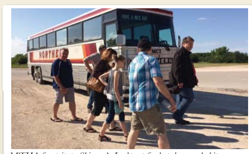
MTHA fan trip to Skinner's Lockport for hot dogs and chips.