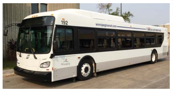
Winnipeg Transit #192, a 2017 New Flyer model XD40.

The City expects to take delivery of the new bus and have it in service in January 2018. ■