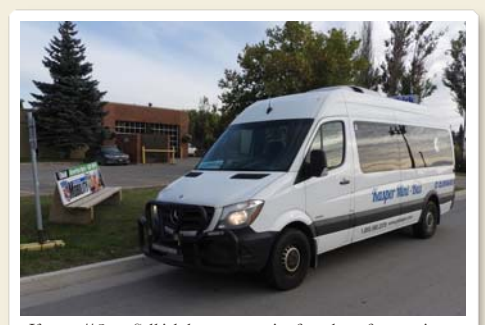
Kasper #3 at Selkirk bus stop on its first day of operation.

On Tuesday, September 5th, 2017 Kasper Transportation of Thunder Bay, Ontario assumed operation of public transit service on the 113 year old Selkirk-Winnipeg commuter line.