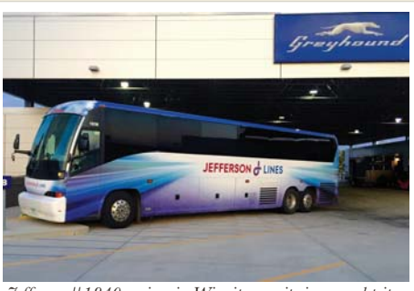
Jefferson #1840 arrives in Winnipeg on its inaugural trip.

located in the Greyhound Canada Terminal at the Winnipeg International Airport and will connect with Greyhound 's mainline national service. Jefferson provides a key link to Grand Forks and Fargo, North Dakota, Sioux Falls, South Dakota, Minneapolis, Minnesota and Milwaukee, Wisconsin.