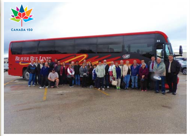
The MTHAs successful Canada 150 celebration fan trip to Portage La Prairie.