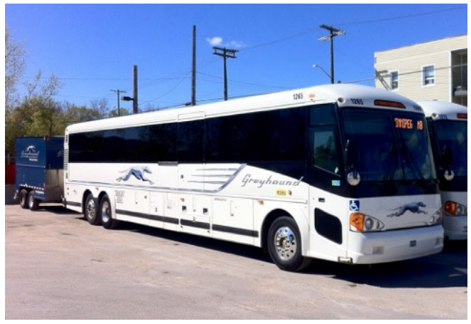
A Greyhound Canada MCI D4505 arrived in Winnipeg on schedule 5442.