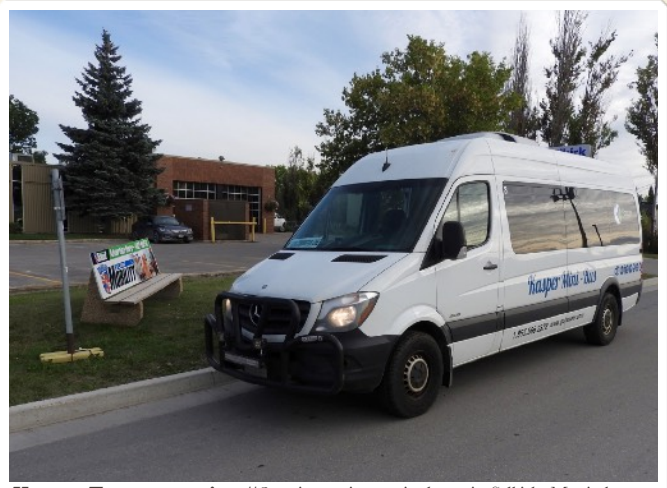
Kasper Transportation #3 arrives at its terminal stop in Selkirk, Manitoba.

All photographs © Copyright by Alex P. Regiec. Used with permission.