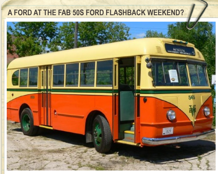
Ex-Winnipeg Electric #565, a 1942 Ford Transit model 69B is ready to travel and showcase.