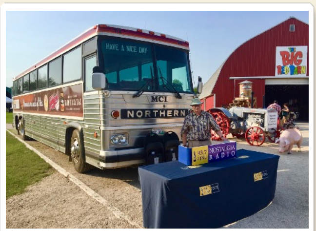
Senior's Day Red River Ex on Wednesday, June 20th.