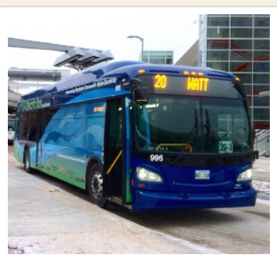
New Flyer test electric bus re-charging at Winnipeg Airport transit terminal.

Only time will tell how may more decades the motor bus dominates Winnipeg's transit scene.