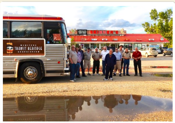
Annual General Meeting on the road to Lockport on Tuesday, June 12th.