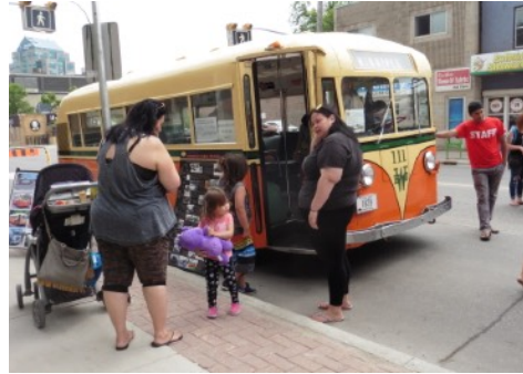
Ellice Avenue Street Festival on Saturday, June 9th.