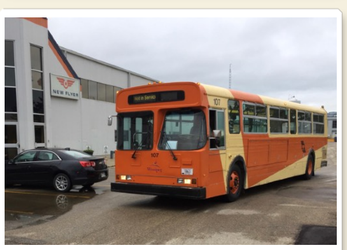
New Flyer Industries Employee Bar-B-Que on Wednesday, July 25th.