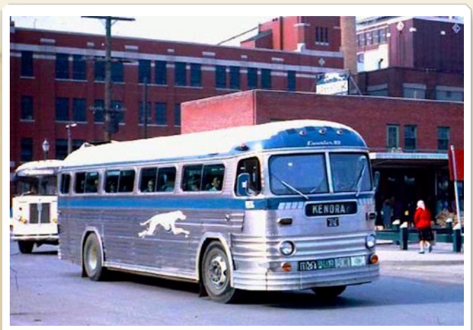
A Greyhound coach departing Winnipeg's Union Bus Depot in 1955.