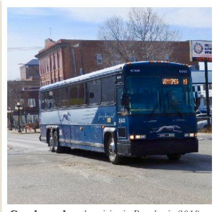
Greyhound coach arriving in Brandon in 2018.

Or just maybe, we'll have a completely different story to tell.