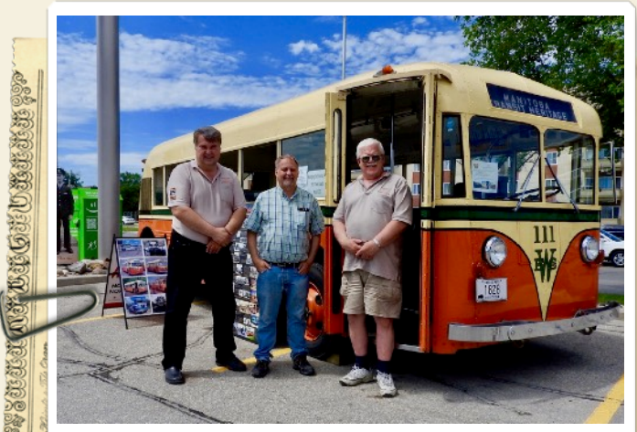
Sunday Night Cruise at the Pony Coral on Sunday, July 8th.