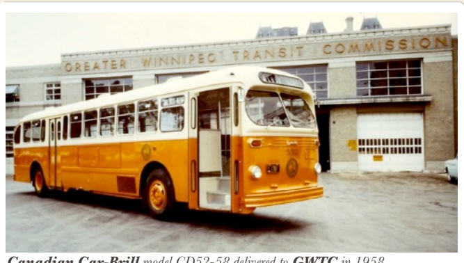
Canadian Car-Brill model CD52-58 delivered to GWTC in 1958.