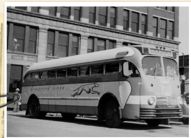
A Greyhound coach at Winnipeg's Union Bus Depot in 1946.