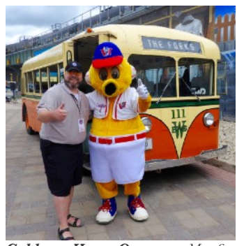
Goldeyes Home Opener on May 6.