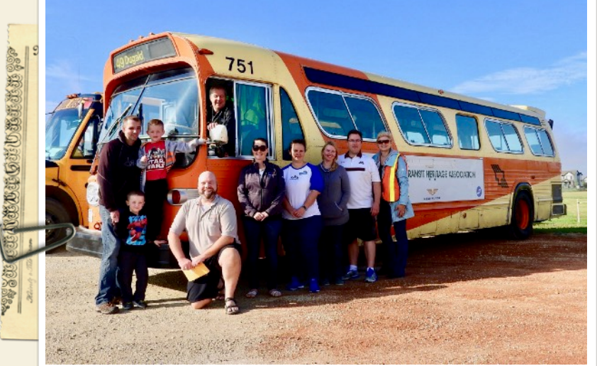
MTHA volunteers with guests at the Touch-A-Truck fundraiser in Dugald, Manitoba.