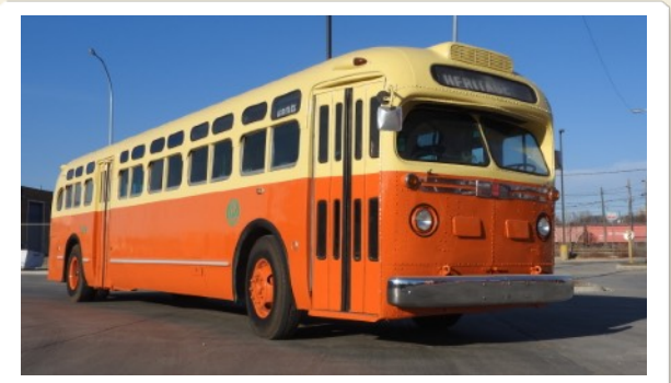
MTHA bus #188 freshly painted in the GWTC livery.

GWTC 188 isn't an exact match for any of Winnipeg's "old looks". At 37<sup>3</sup>/4ft it falls in between the 35ft models bought in 1956 and the 40ft units acquired from Transcona in 1963. Bus 188 is new to Winnipeg, and has had one of the most unusual histories for a preserved bus anywhere. It was originally built to its odd length in 1954 for California's then-current axle loading restrictions, and delivered to the transit system in Los Angeles. It was eventually sold second hand to Sacramento before being resold third hand to BC Transit. BC Transit assigned it first to Victoria, and then later to Nanaimo. Its commercial career came to an end in 1987 when it was sold, fourth hand, to a private collector. As part of preparations to celebrate its 2011 Centennial, Regina Transit purchased it, fifth hand, and restored it. Number 188 came to its sixth owner (and seventh home) in 2016 when Manitoba Transit Heritage Association received #188 as a donation from Regina.