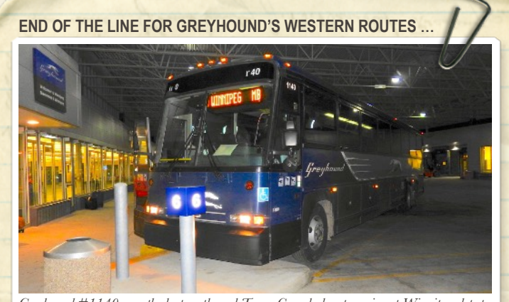
Greyhound #1140 was the last eastbound Trans-Canada bus to arrive at Winnipeg depot.