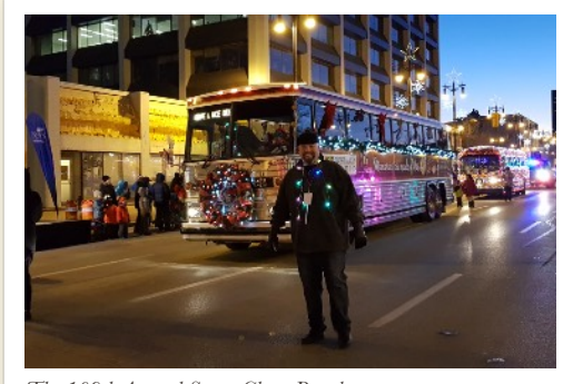
MTHA volunteers at 2018 Santa Claus Parade.