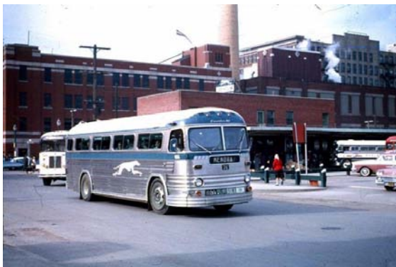
1925 - 1964: Winnipeg Bus Depot on Graham Av. at Hargrave St.