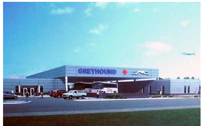
2009 - future: New Winnipeg Bus Depot at the International Airport.

After a two years of planning and construction, Greyhound Canada Transportation Corporation will move into its new Manitoba Division offices and bus depot this summer. The new facility is located next to the James Armstrong Richardson International Airport and provides new inter-modal transfer opportunities for intercity bus passengers and airline travellers in Manitoba.