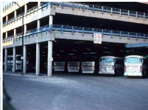
1964 - 2009: Winnipeg Bus Depot on Portage Av. at Balmoral St.