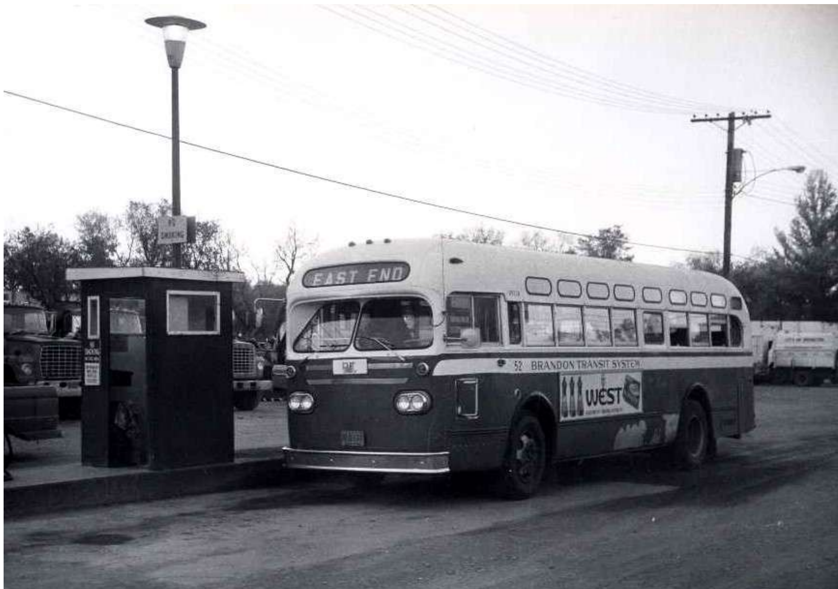
Brandon Transit bus 52, a 1967 General Motors Coach model TDH-3501, preparing to depart from the yard.