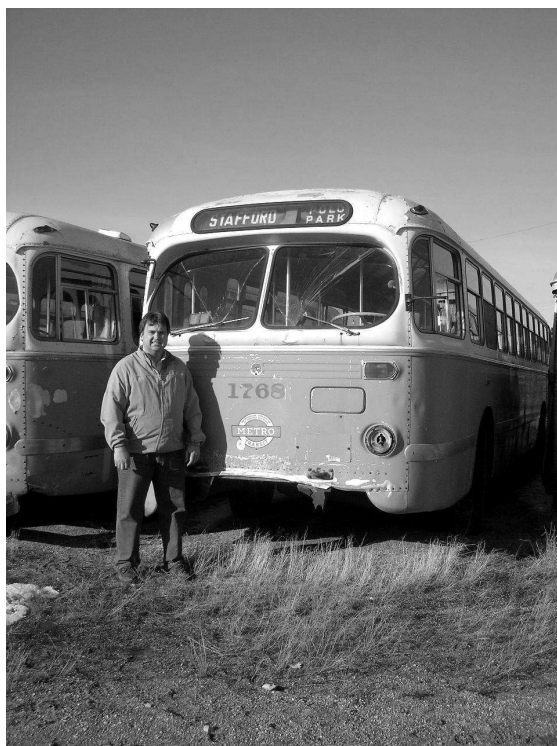
Starting on the top left and in clockwise order: Manitoba Transit Heritage Association President Alex Regiec stands beside trolley coach 1768 at its rural storage site; the interior of 1768 looking toward the front of the bus; a close-up shot of the driver's work station; and a view of the rear interior section of the vintage trolley coach.

MTHA members are encouraged to volunteer for this historic display at the Red River Exhibition from June 13th until June 22nd.