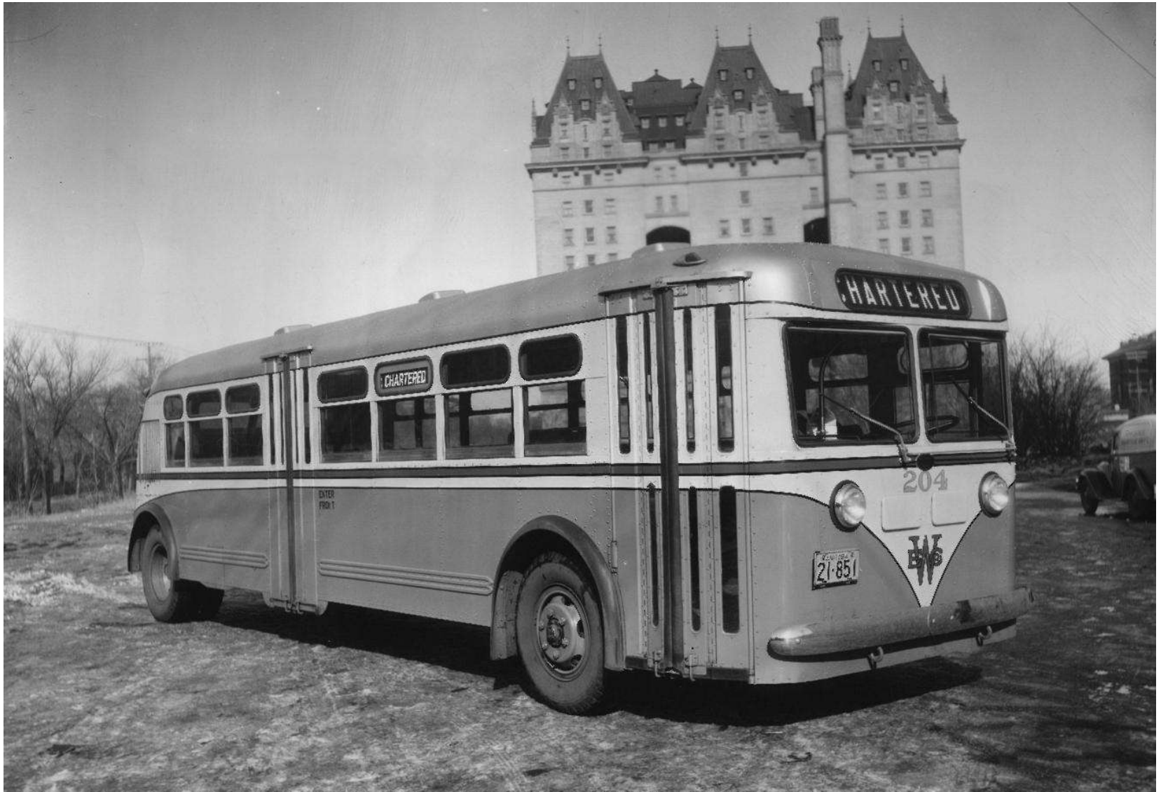
Winnipeg Electric Co. bus No. 204, a 1941 Twin Coach model 30GS pictured here at the Fort Street garage adjacent to the majestic Fort Garry Hotel seen in the background.

If you have a photograph of a vintage transit vehicle from anywhere in Manitoba that you would like to share, please send it to the Manitoba Transit Heritage Association Inc. c/o 421 Osborne Street, Winnipeg, MB R3L 2A2