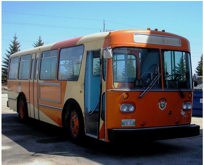
Dubbed the Persephone, bus 953 is a 1981 Orion I which was originally part of the Winnipeg Transit fleet, later a part of the Fire Paramedic service, and is now in the care of the MTHA bus preservation program.

As for a name for the vehicle, Pat Rogoski offered "the sound of this bus reminds me of the Persephone, the boat from the Beachcombers TV show!"