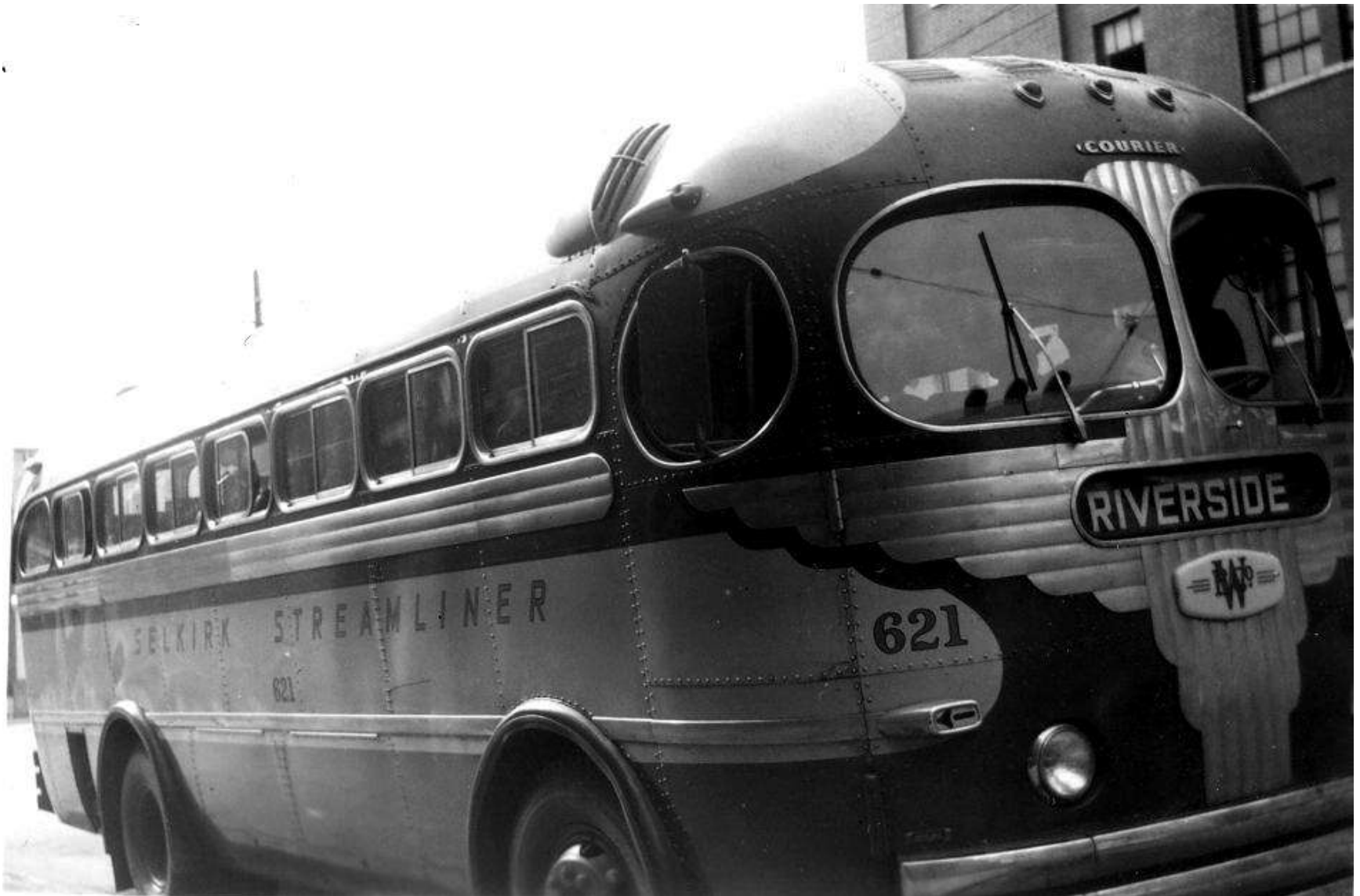
Winnipeg Electric Co. "Selkirk Streamliner" bus No. 621, a 1947 MCI Courier 100A seen leaving the Union Bus Depot destined for Riverside, Manitoba.

If you have a photograph of a vintage transit vehicle from anywhere in Manitoba that you would like to share, please send it to the Manitoba Transit Heritage Association Inc. P.O. Box 2388 Winnipeg, Manitoba R